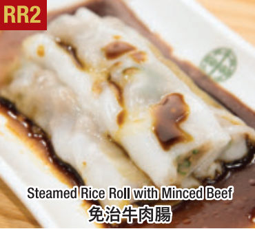
RR2 Steamed Rice Roll with Minced Beef 免治牛肉腸