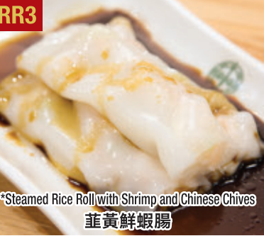
RR3 *Steamed Rice Roll with Shrimp and Chinese Chives 韭黃鮮蝦腸