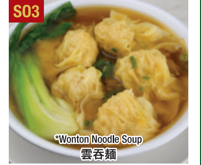
S03 *Wonton Noodle Soup 雲吞麵