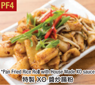
PF4 *Pan Fried Rice Roll with House Made XO sauce 特製 XO 醬炒腸粉