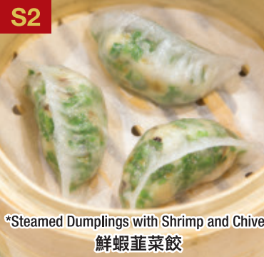
S2 *Steamed Dumplings with Shrimp and Chives 鮮蝦韭菜餃