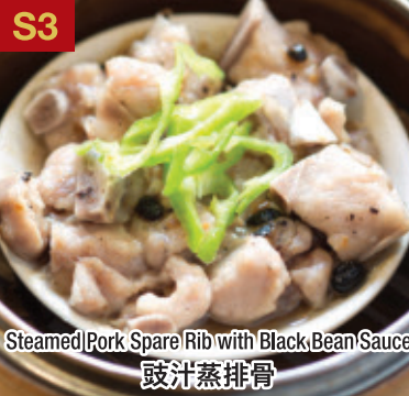
S3 Steamed Pork Spare Rib with Black Bean Sauce 豉汁蒸排骨