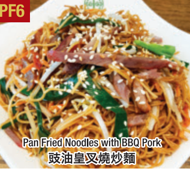
PF6 Pan Fried Noodles with BBQ Pork 豉油皇叉燒炒麵