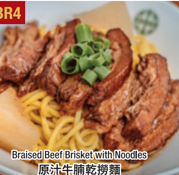
BR4 Braised Beef Brisket with Noodles 原汁牛腩乾撈麵