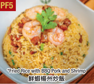
PF5 *Fried Rice with BBQ Pork and Shrimp 鮮蝦揚州炒飯