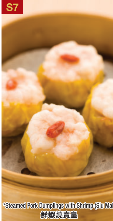
S7 *Steamed Pork Dumplings with Shrimp (Siu Mai) 鮮蝦燒賣皇