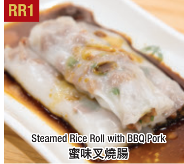
RR1 Steamed Rice Roll with BBQ Pork 蜜味叉燒腸