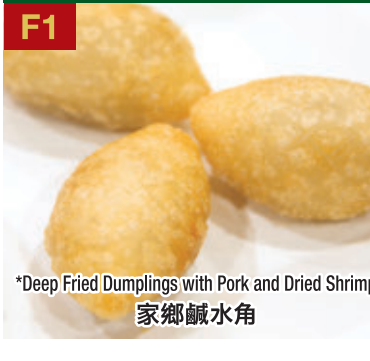
F1 *Deep Fried Dumplings with Pork and Dried Shrimp 家鄉鹹水角