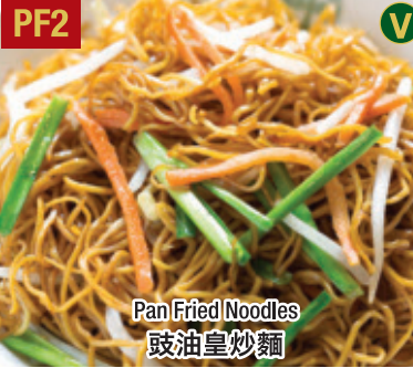
PF2 Pan Fried Noodles 豉油皇炒麵