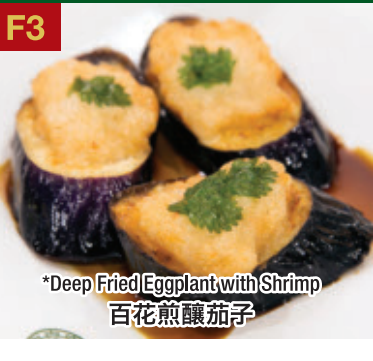
F3 *Deep Fried Eggplant with Shrimp 百花煎釀茄子