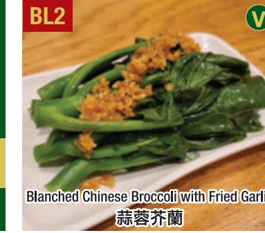
BL2 Blanched Chinese Broccoli with Fried Garlic 蒜蓉芥蘭