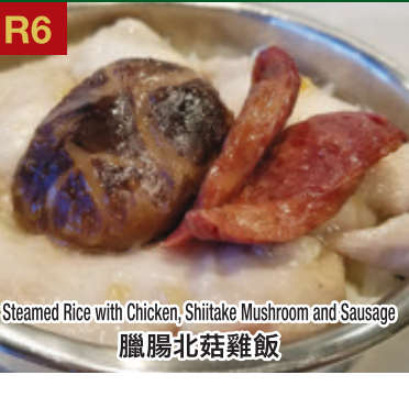
R6 Steamed Rice with Chicken, Shiitake Mushroom and Sausage 臘腸北菇雞飯