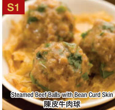
S1 Steamed Beef Balls with Bean Curd Skin 陳皮牛肉球