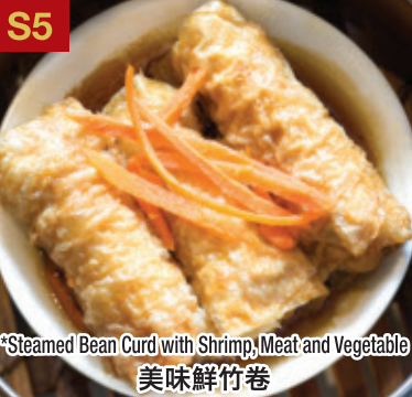
S5 *Steamed Bean Curd with Shrimp, Meat and Vegetable 美味鮮竹卷