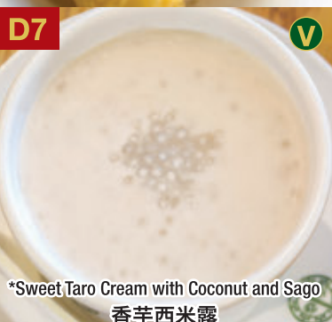
D7 *Sweet Taro Cream with Coconut and Sago 香芋西米露