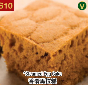
S10 *Steamed Egg Cake 香滑馬拉糕