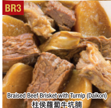
BR3 Braised Beef Brisket with Turnip (Daikon) 柱侯蘿蔔牛坑腩