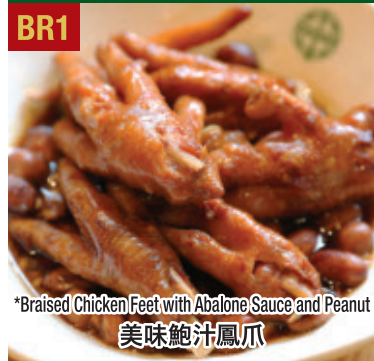
BR1 *Braised Chicken Feet with Abalone Sauce and Peanut 美味鮑汁鳳爪