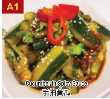
A1 Cucumber in Spicy Sauce 手拍黃瓜