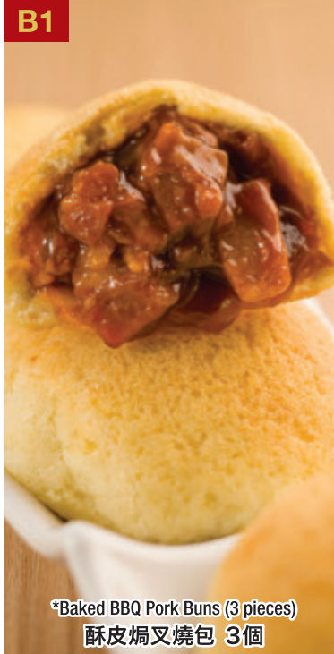
B1 *Baked BBQ Pork Buns (3 pieces) 酥皮焗叉燒包 3個