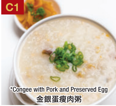
C1 *Congee with Pork and Preserved Egg 金銀蛋瘦肉粥