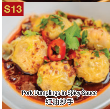
S13 Pork Dumplings in Spicy Sauce 紅油抄手