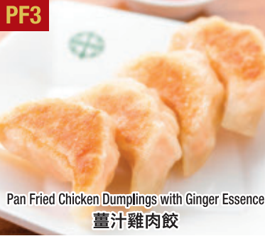
PF3 Pan Fried Chicken Dumplings with Ginger Essence 薑汁雞肉餃