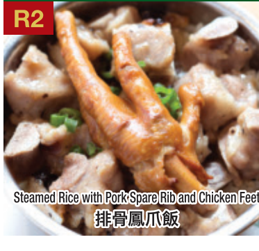
R2 Steamed Rice with Pork Spare Rib and Chicken Feet 排骨鳳爪飯