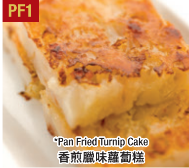
PF1 *Pan Fried Turnip Cake 香煎臘味蘿蔔糕