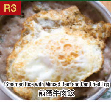
R3 Steamed Rice with Minced Beef and Pan Fried Egg 煎蛋牛肉飯