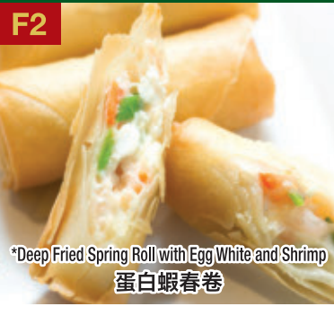
F2 *Deep Fried Spring Roll with Egg White and Shrimp 蛋白蝦春卷