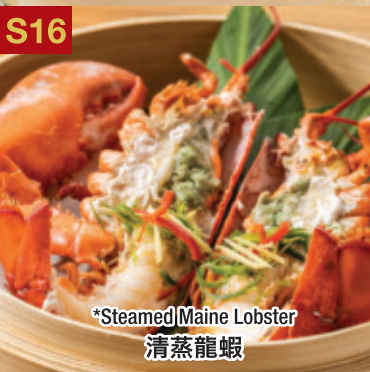
S16 *Steamed Maine Lobster 清蒸龍蝦