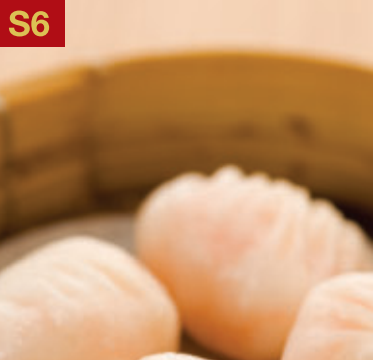
S6 *Steamed Shrimp Dumplings (Har Gow) 晶瑩鮮蝦餃