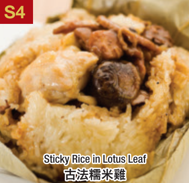
S4 Sticky Rice in Lotus Leaf 古法糯米雞