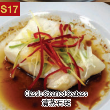
S17 Classic Steamed Seabass 清蒸石斑