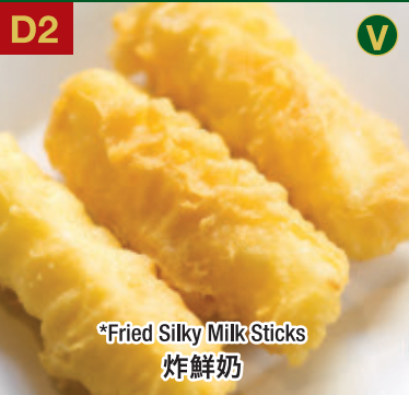
D2 *Fried Silky Milk Sticks 炸鮮奶